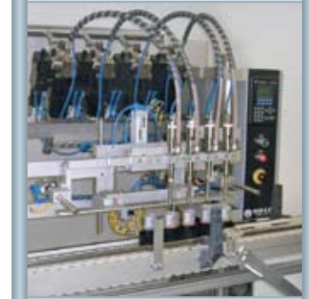
High Viscosity Make-up Filler with Star Wheel Indexing System